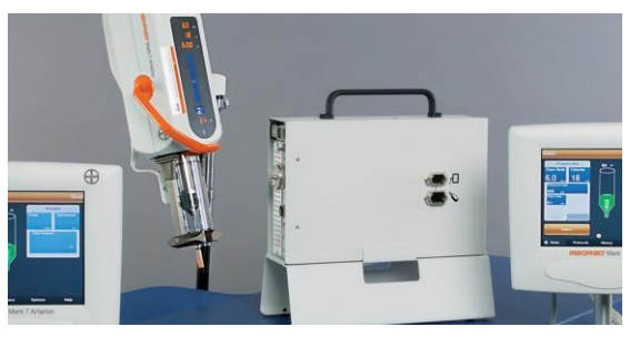
MEDRAD® Mark 7 Arterion Table Mount with Dual Monitor Option*