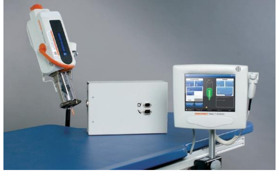
MEDRAD® Mark 7 Arterion Table Mount*